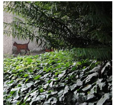
A life-size cat figure in the garden of Huttenstrasse 9, Zurich, where Erwin Schrödinger lived 1921–1926. Depending on the light conditions, the cat appears either alive or dead.

The prevailing theory, called the Copenhagen interpretation , says that a quantum system remains in superposition until it interacts with, or is observed by the external world. When this happens, the superposition collapses into one or another of the possible definite states . The EPR experiment shows that a system with multiple particles separated by large distances can be in such a superposition. Schrödinger and Einstein exchanged letters about Einstein's EPR article , in the course of which Einstein pointed out that the state of an unstable keg of gunpowder will, after a while, contain a superposition of both exploded and unexploded states. [4]