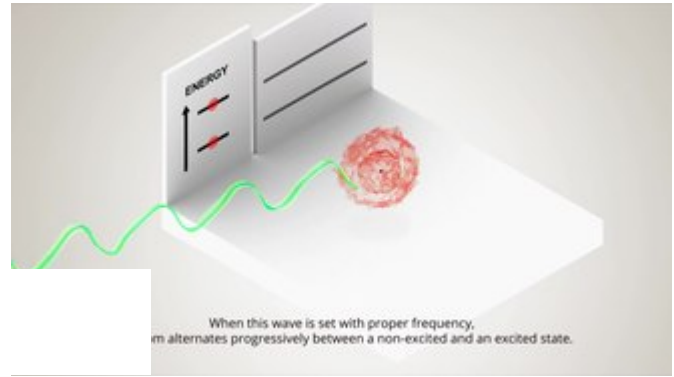
Schrödinger's cat quantum superposition of states and effect of the environment through decoherence

The experiment as described is a purely theoretical one, and the machine proposed is not known to have been constructed. However, successful experiments involving similar principles, e.g. superpositions of relatively large (by the standards of quantum physics) objects have been performed. [30] These experiments do not show that a cat-sized object can be superposed, but the known upper limit on "cat states" has been pushed upwards by them. In many cases the state is short-lived, even when cooled to near absolute zero .